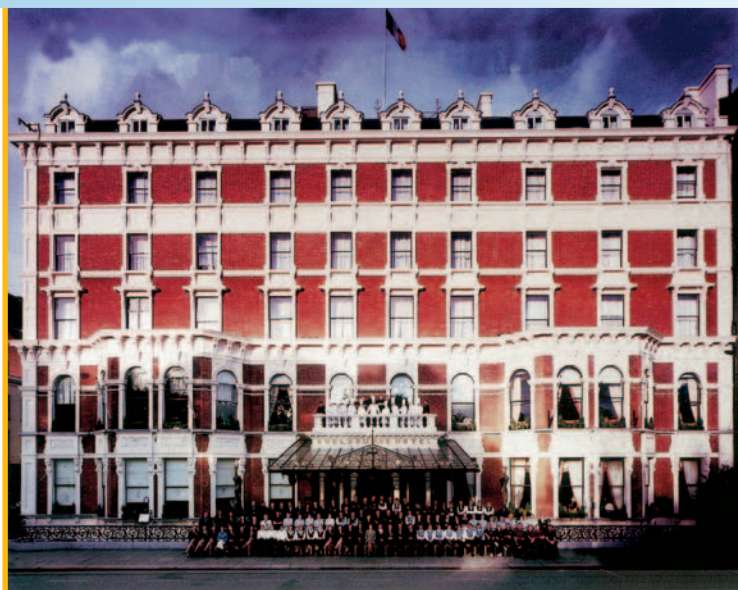
Le Meridien Shelbourne Hotel, Dublin, Ireland

Study the job titles and then match each photo with a job.