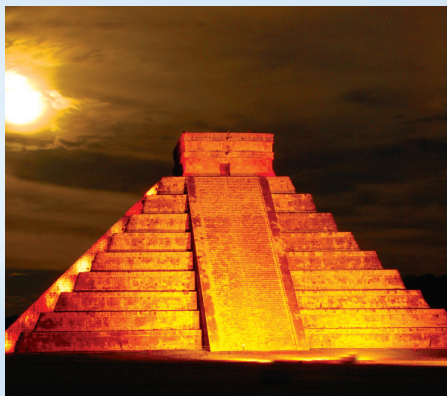
A Mayan temple

The Mayans were very religious people. They believed in many gods, not just one. There were gods of the wind, of the rain, and of the sun. They even had a god of chocolate called Ixcacao . They built special buildings, temples, where they talked to their gods.