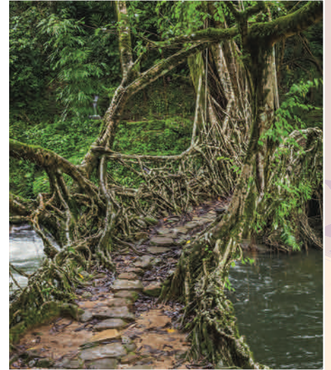
This bridge is 500 years old and is made of living tree roots.

How wet? Very! It has more rain a year than any other town on the planet: almost 12 meters! For example, a “normal” city like New York has around one meter of rain every year. In Meghalaya, the combination of heat and rain means that lots of structures don't last very long. One solution they have discovered is to make bridges using living tree roots.