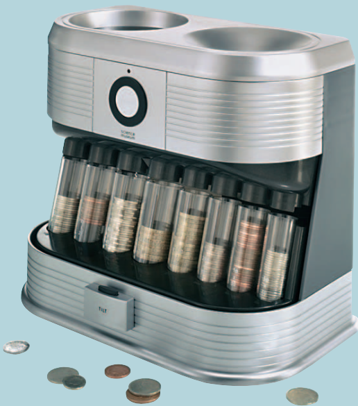
a coin sorter

Imagine you are going to give a product presentation for one of the products below. a Choose the product you would like to present.