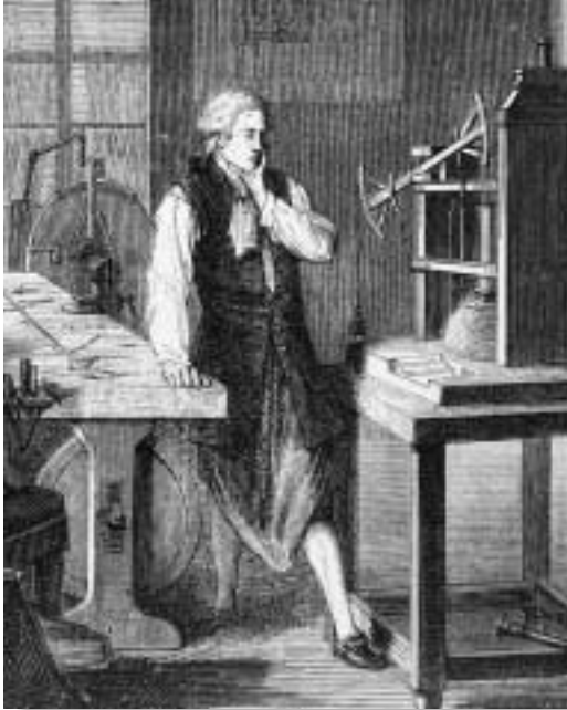
1775: James Watt invents the first reliable steam engine.