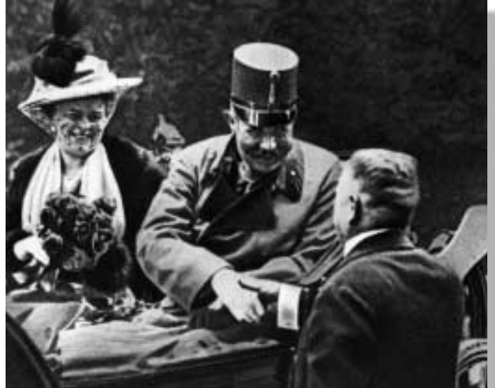
June 28, 1914: Assassination of Archduke Franz Ferdinand