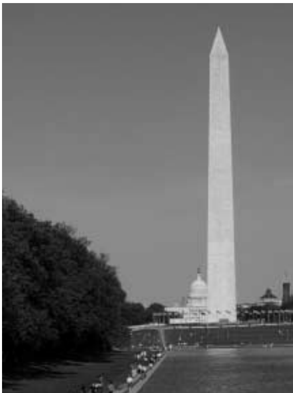
The Washington Monument