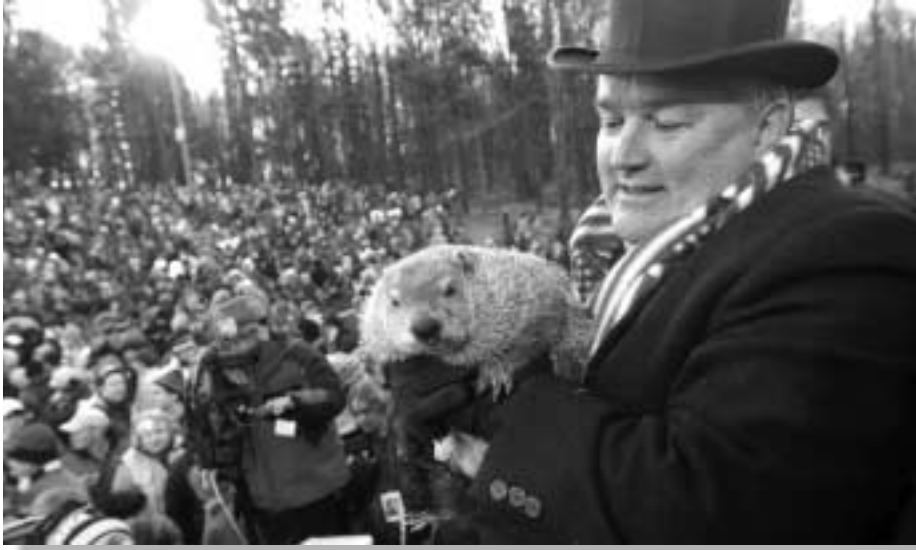
Punxsutawney Phil on Groundhog Day