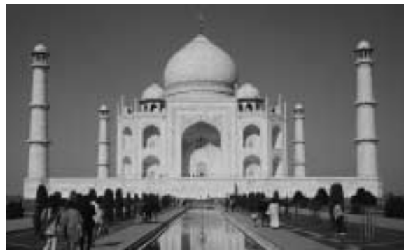
The Taj Mahal