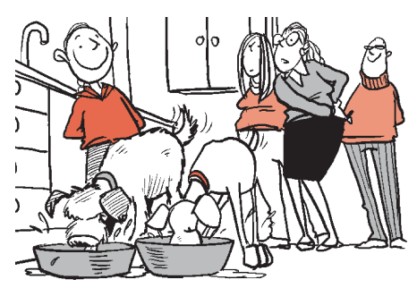
When I said, 'Give them a drink', I didn't mean them, I meant the people.