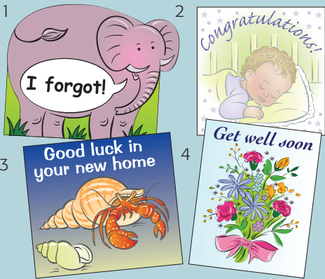
Photo a Photo c Photo b Photo d