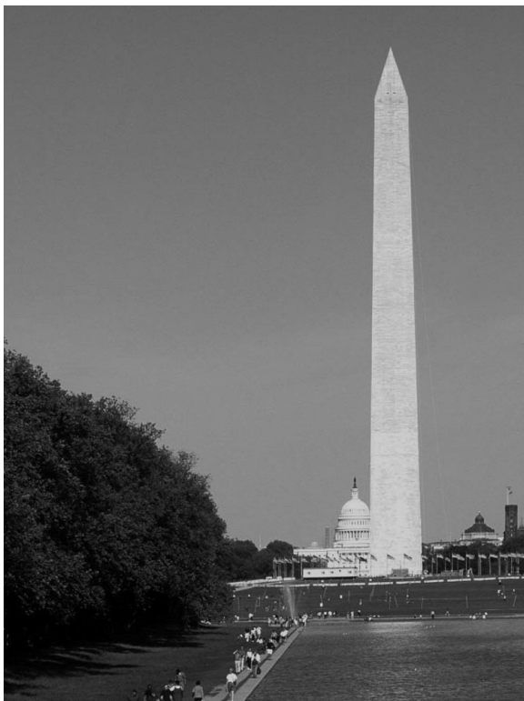
The Washington Monument