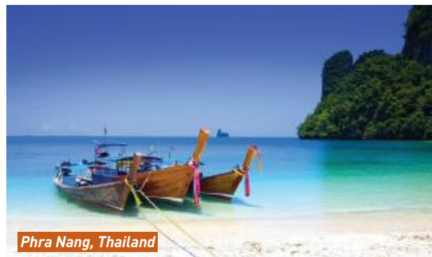
Phra Nang, Thailand