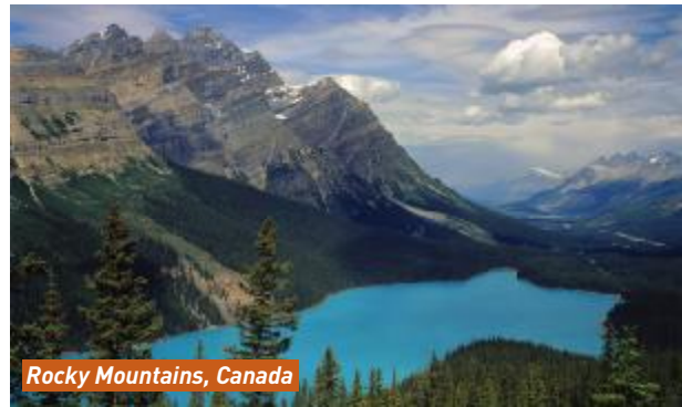
Rocky Mountains, Canada