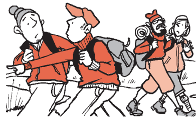
They told us to go this way.