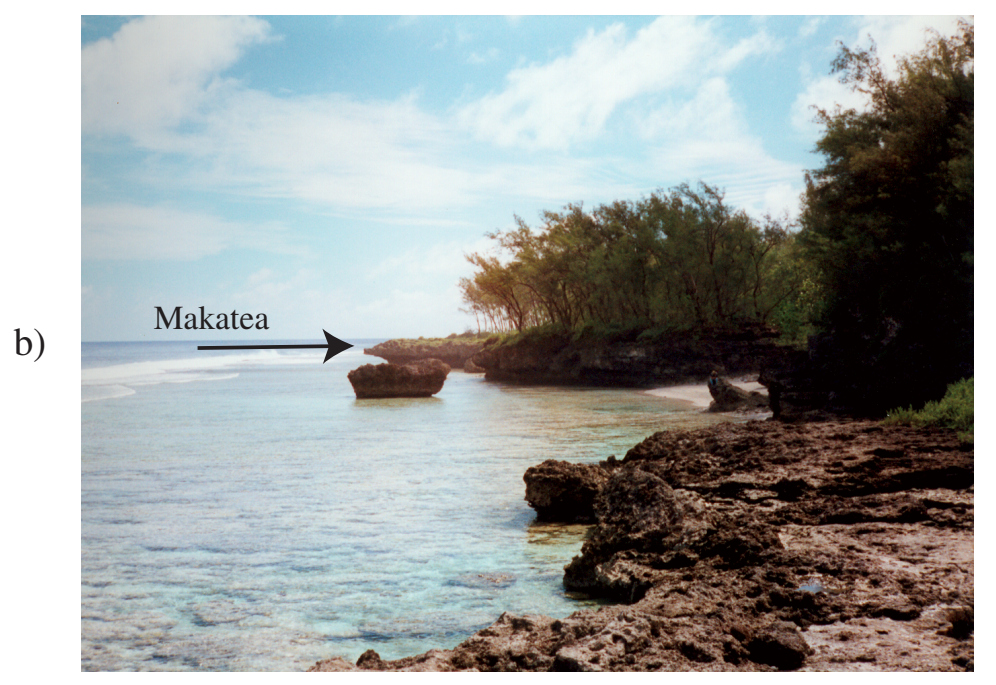
Fig. 4.32. Atiu island in the Southern Cook Islands. a) Schematic geological cross-section of the uplifted island of Atiu in the Southern Cook Islands. Reproduced in part from Fig. 1 of Jarrard and Turner (1979), copyright by the American Geophysical Union. b) Ora Varu beach (site of Captain Cook's landing on April 4<sup>th</sup>, 1777) showing the makatea.