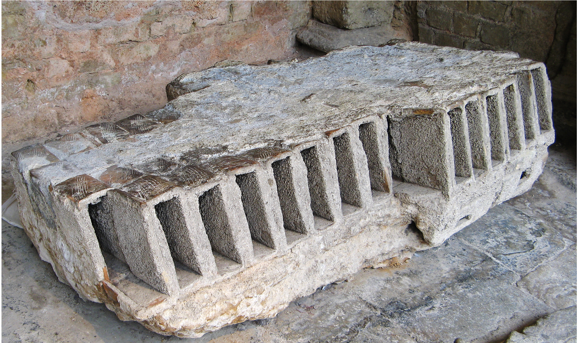
Web Figure 29 (=Figure 96B). Baths at Sanctuary of Sulis Minerva at Bath, England. Piece of fallen hollow voussoir vaulting lying with intrados up. Voussoirs are 31 cm tall. The extrados has long thin rectangular box-tiles attached with crushed terracotta mortar (far left). Box-tiles have interior width of 13.5 cm and are 44 cm long on exterior.