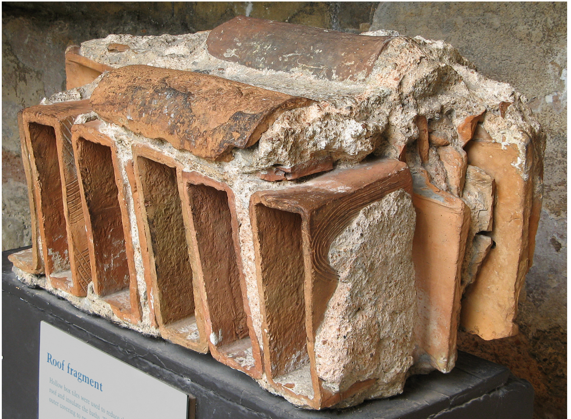
Web Figure 28 (=Figure 96A). Baths at Sanctuary of Sulis Minerva at Bath, England. Piece of fallen hollow voussoir vaulting from crown of a vault with a spine made of pieces of tegulae . Voussoirs are 31 cm tall. Mortar is made with crushed terracotta.