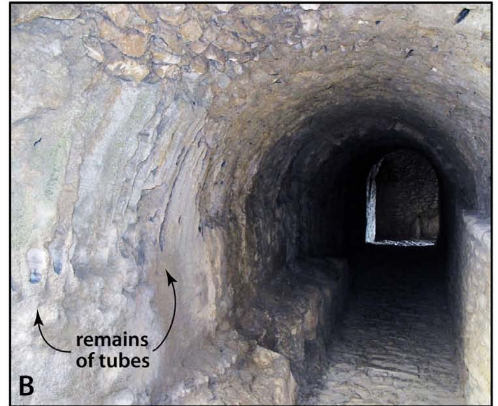
Web Figure 26 (=Figure 78). "Licinian" Baths at Dougga, Tunisia (third century CE). Two substructure galleries built using different techniques. A. Vault with impressions of reed mats along intrados. Centering holes visible at left. B: Vault with remains of vaulting tubes along intrados visible at left.