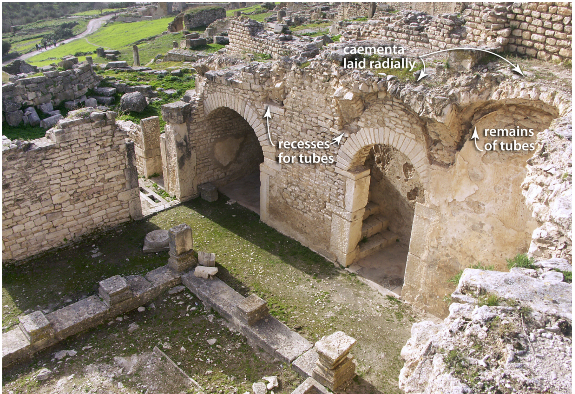
Web Figure 25 (=Figure 77). House of Dionysus and Ulysses at Dougga, Tunisia (second half of third century CE). Remains of cross vaulted portico built on shell of vaulting tubes.