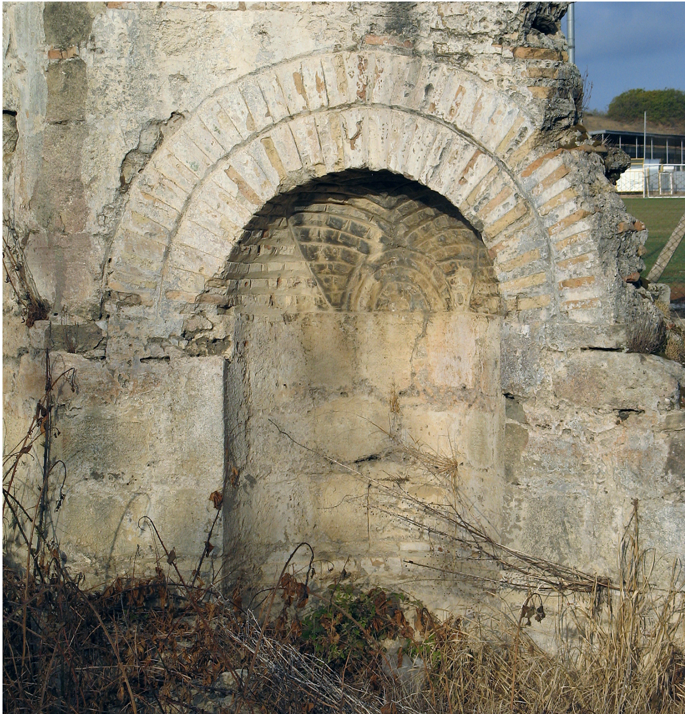
Web Figure 23. East Tomb at Side, Turkey. Detail of niche showing the decorative pitched brick in the semidome.