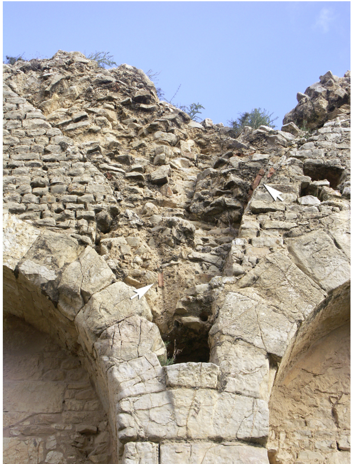
Web Figure 24. Baths of Julia Memmia at Bulla Regia, Tunisia (c. 230 CE). Detail of the radially-laid caementa over a shell of vaulting tubes. Arrows indicate remains of tubes