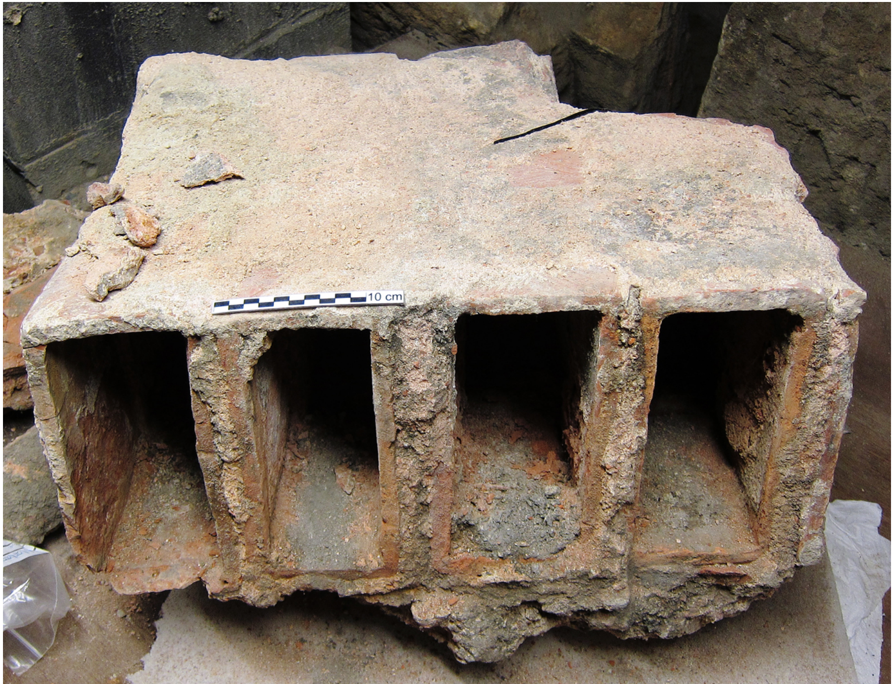
Web Figure 30 (=Figure 96C). Baths at Sanctuary of Sulis Minerva at Bath, England. Piece of hollow voussoir vaulting from York Street storeroom with intrados up and crushed brick mortar still attached to extrados. Voussoirs are 22.5 cm tall.