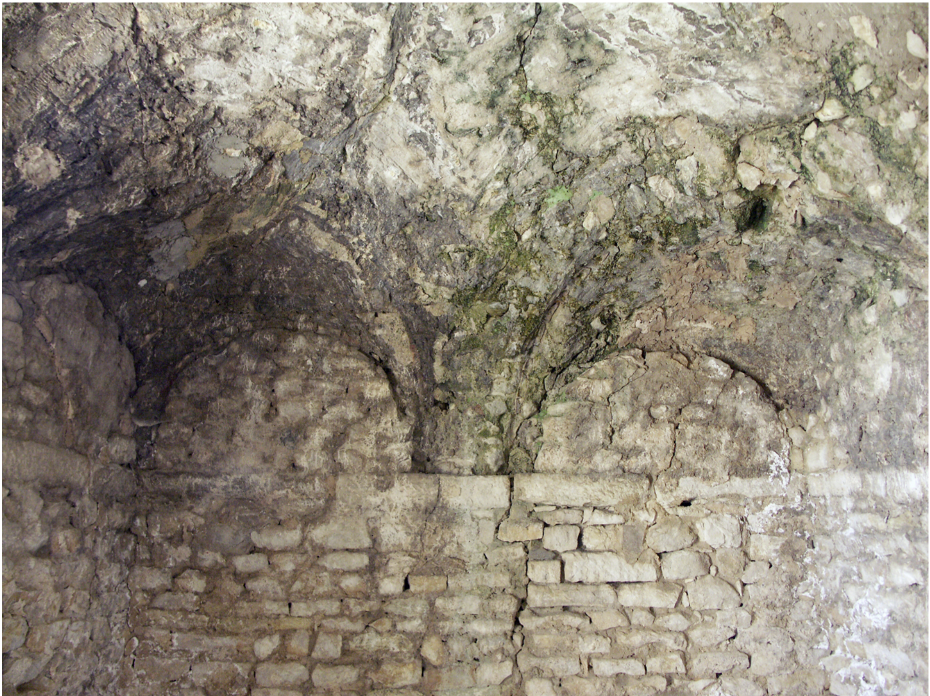
Web Figure 27. House of Ducks and Seasons at Dougga, Tunisia. View of composite sail vault constructed on vaulting tubes (a few tube fragments remain in the grooves along the intrados).