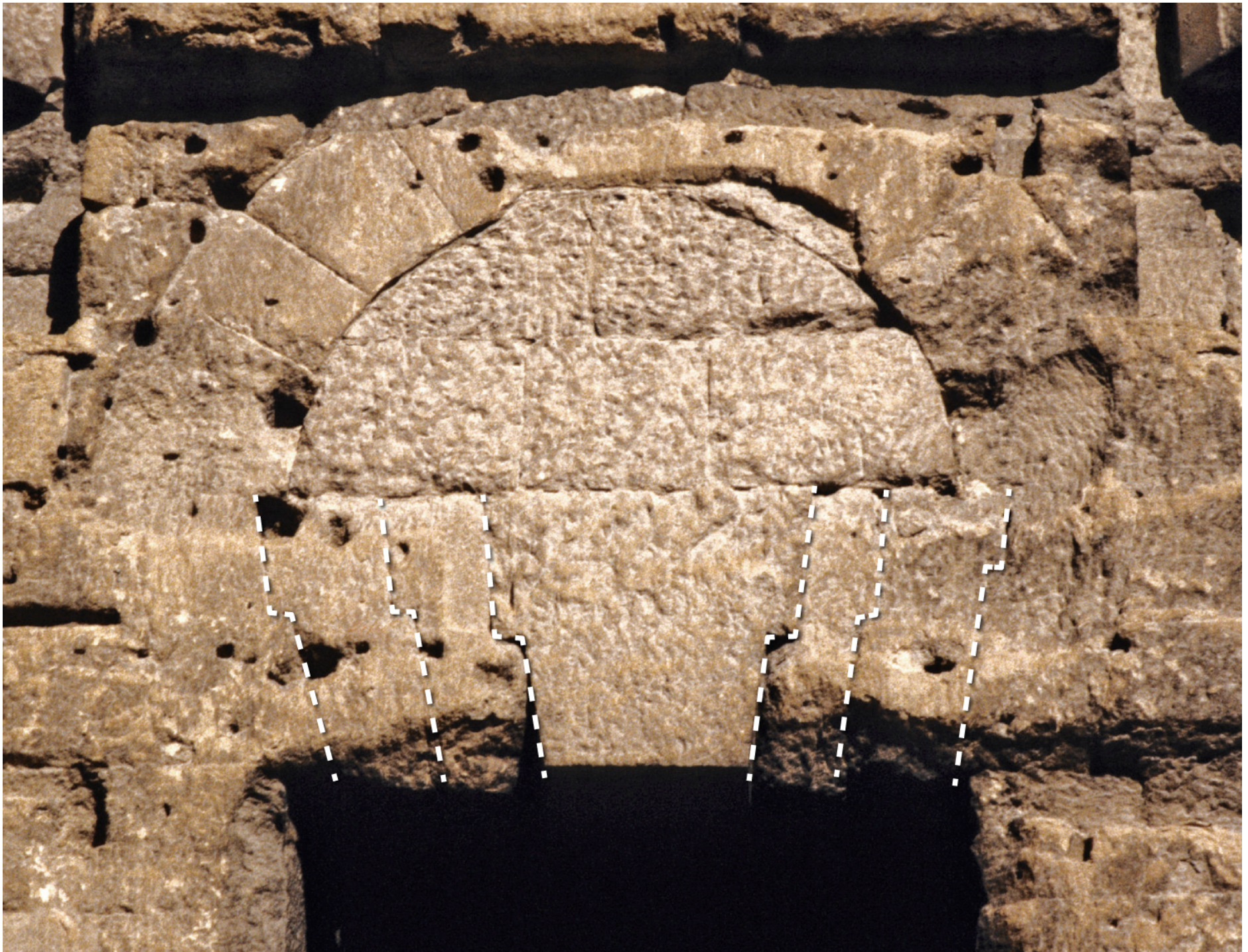
Web Figure 32. Theater at Orange, France. Lintel arch with joggle joints (marked in dashed lines).