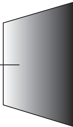
filter polarizing at direction b